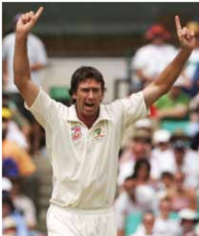
TOP LEFT: Brian Lara scored 34 Test centuries in a career that spanned 17 years.