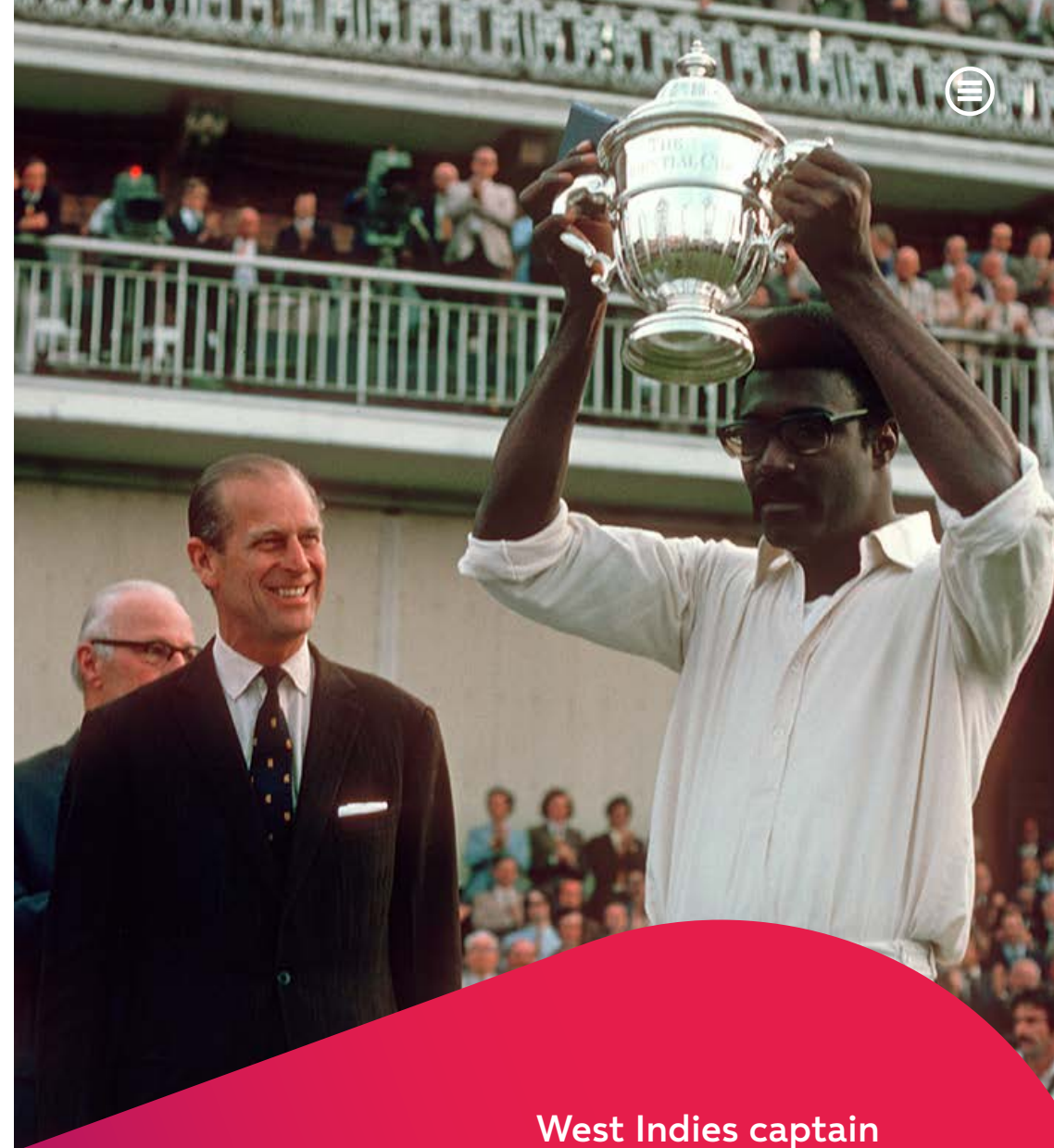
West Indies captain Clive Lloyd holds the trophy aloft at Lord's in 1975 after receiving it from HRH Prince Philip.

The ICC Women's World Cup has been played since 1973, most recently in 2017 when England won a memorable final against India at Lord's.